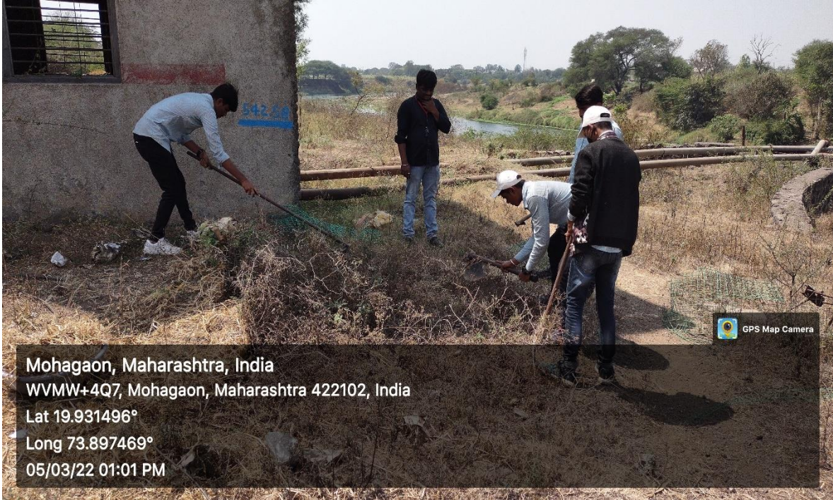
Mohagaon, Maharashtra, India WVMW+4Q7, Mohagaon, Maharashtra 422102, India Lat 19.931496° Long 73.897469° 05/03/22 01:01 PM