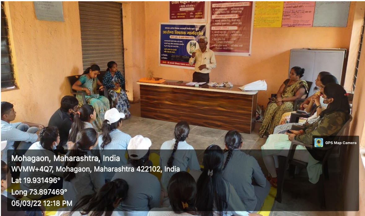
Mohagaon, Maharashtra, India WVMW+4Q7, Mohagaon, Maharashtra 422102, India Lat 19.931496° Long 73.897469° 05/03/22 12:18 PM