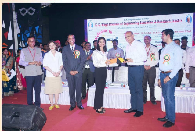
Prize distribution program of Maffick