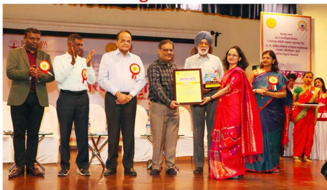
Best Institute Award