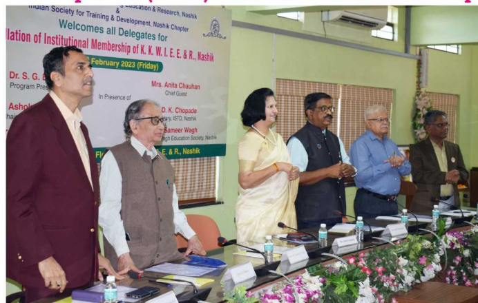
Installation programme of Indian Society for Training and Development (ISTD)