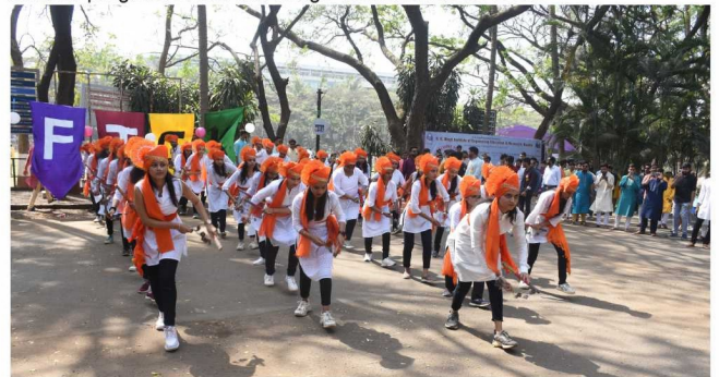
"Lezim" performance during Maffick