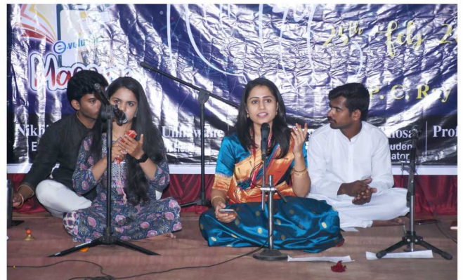
Musical program of Marathi songs "Nakshatranche Dene"