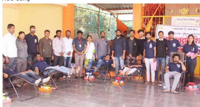
Blood Donation during special ness Camp