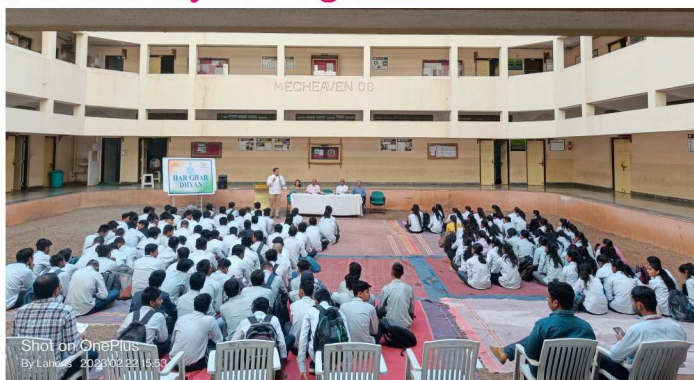
Har Ghar Dhyaan Programme