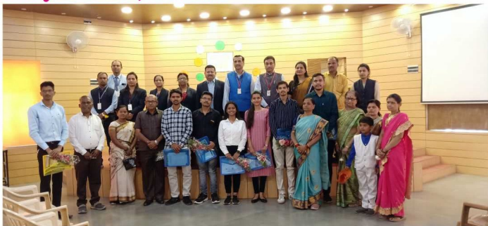
Felicitation of Placed students along with their parents