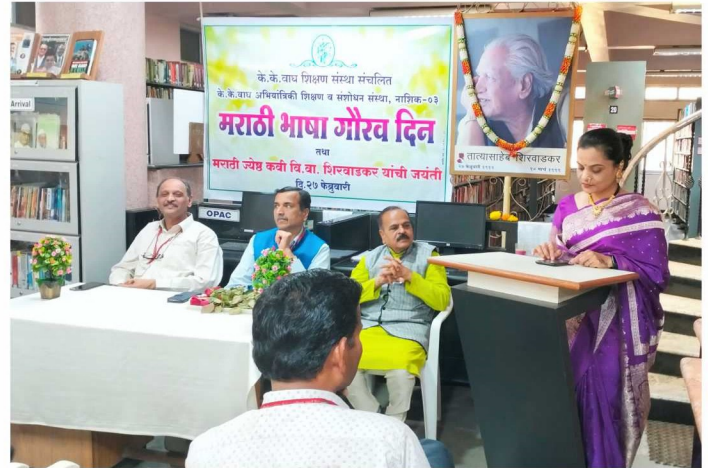
Celebration of Marathi Bhasha Gaurav Din