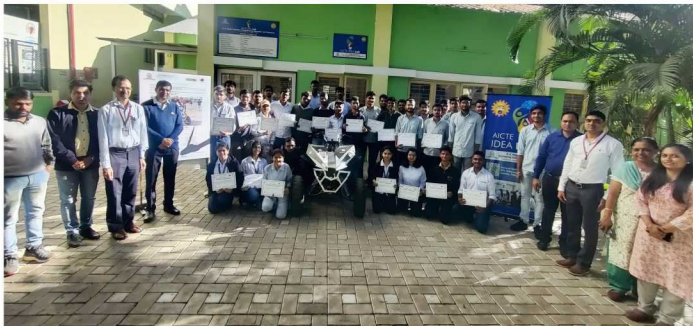
Participants of the Six Days Quad Vehicle Professional Skilling Program