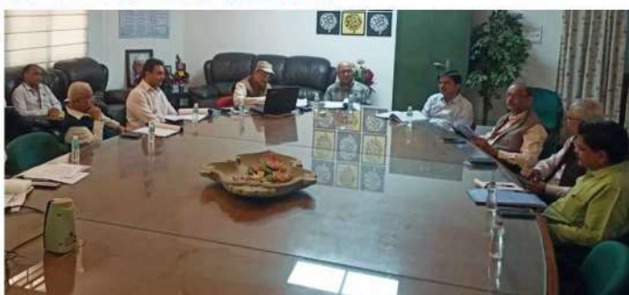
Governing Body Meeting