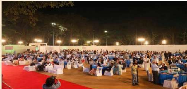
Bird View of Round Table Discussion