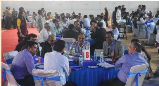
Round Table Discussion

K K Wagh Education Society organized an Industry Leaders Summit 3.0 on 14 th December 2023 at College ground for interaction with CEO/Plant Heads of various industries in Nashik area. Objective of this Industry Leaders Summit 3.0 was to take the inputs from industry leaders and to address the following issues: