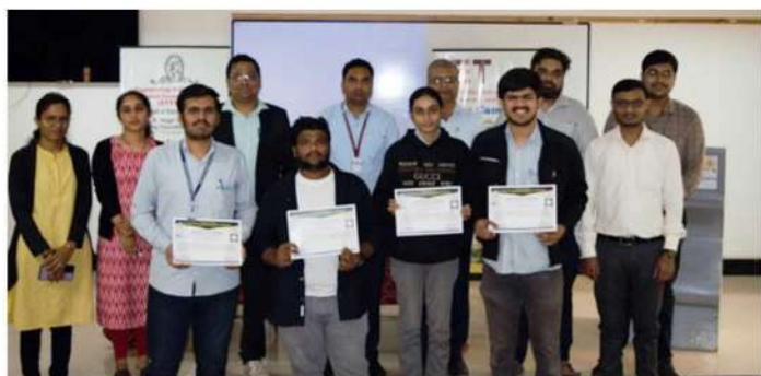
Prize Winners of National Level conference

Department of Electrical Engineering in association with IET Nashik Local Network and EFFECT Student Body of the Department has conducted a National Level Students Conference