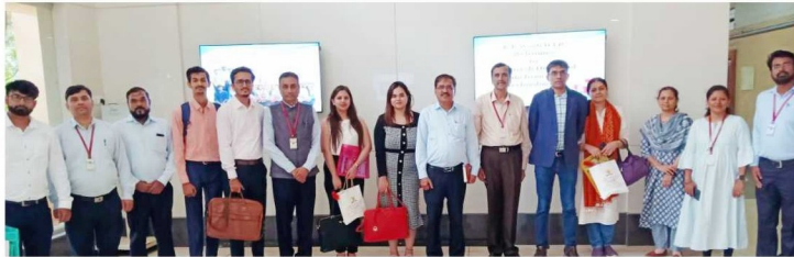
Visit of KPIT Team