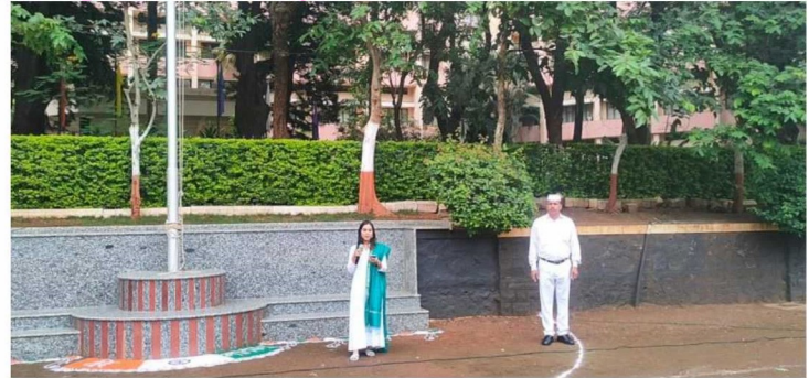
Independence Day celebration