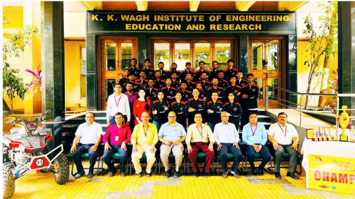
Team Brahmastra with Hon. Chairman, K.K. Wagh Education Society & other leaders