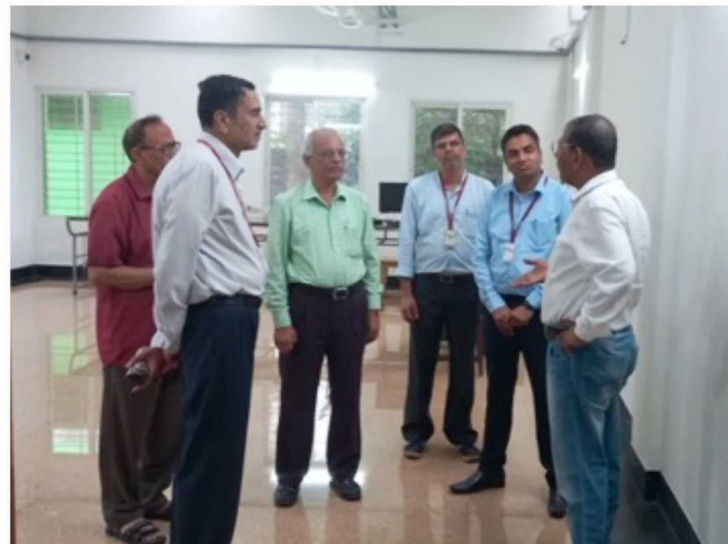
Visit of Experts to AICTE Idea lab of our institute