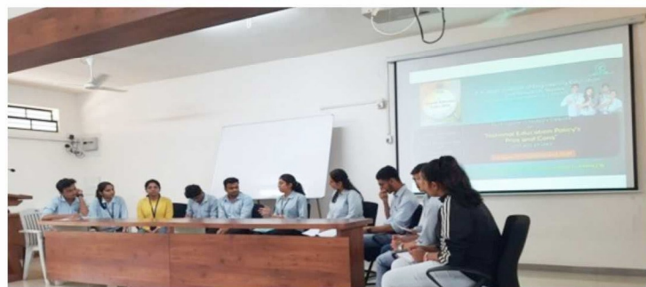
Participants while debating on the topic of NEP 2020