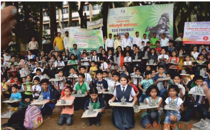
Eco Friendly Shadumati Ganpati Workshop held on 2019