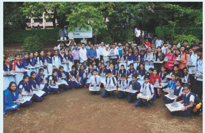
Group of students with Ganesh Idol