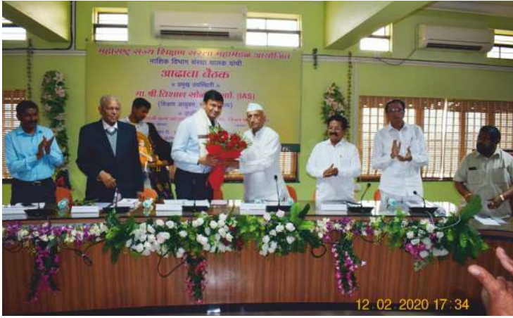
Hon. Vishal Solanki (IAS), Commissioner of Education was felicitated by Hon. President Shri. Balasaheb Wagh during guidance of management representatives of School education in Nashik Region on 2.2.2020