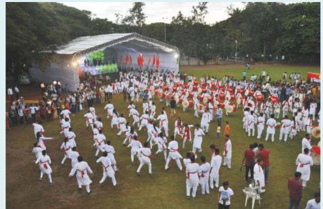
Lazim and Dhol performance