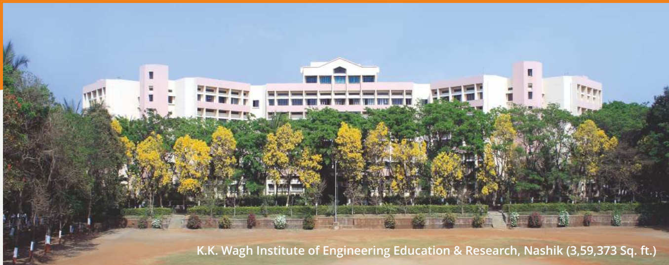
K.K. Wagh Institute of Engineering Education & Research, Nashik (3,59,373 Sq. ft.)