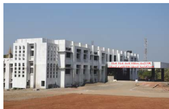
K.K. Wagh Arts, Commerce, Science & Computer Science College, Pimplas (Ramache)