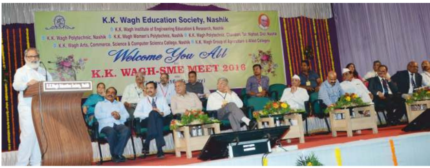
Photograph of SME Meet held on 2016 in Engineering College Campus