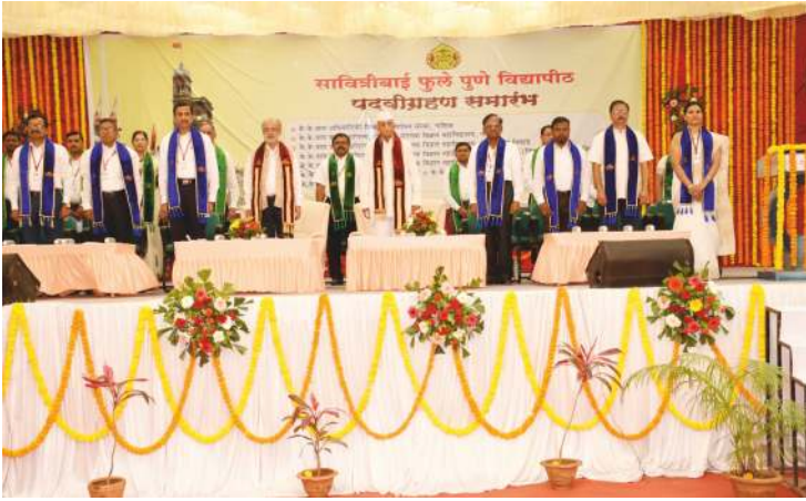
Savitribai Phule Pune University, Pune degree award ceremony held in Engineering College Campus on 7.3.2020