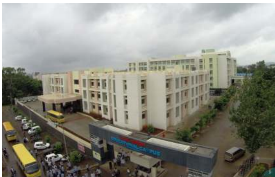
K.K. Wagh Arts, Commerce, Science & Computer Science College, Nashik (90,000sq.ft)

The staff members working are a blend of young and experienced persons and contributing for the social, academic, cultural upliftment of the students and are rendering the valuable services. The non-academic activities like NSS, Sports, Career Guidance Cell, and Personality Development Programs are being conducted regularly. The Management is always behind us to support for academics as well as non-academic activities all their activities ultimately are bringing laurels to the college.