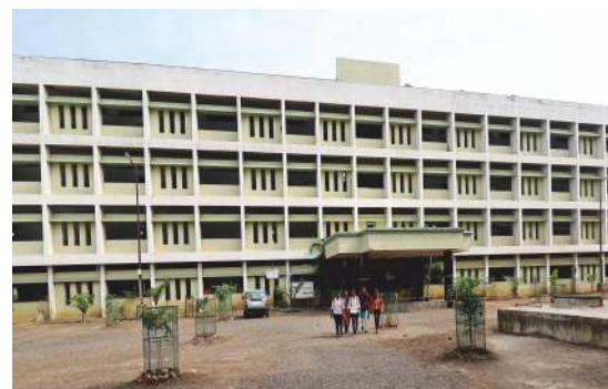
K.K. Wagh Arts, Commerce, Science & Computer Science College, Chandori (36,567sq.ft)