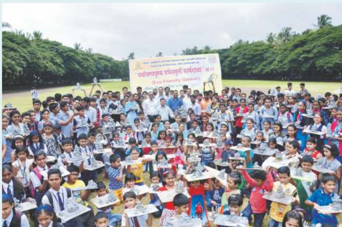
Group of students with Ganesh Idol