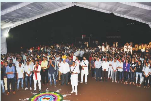
Students during Ganesh Poojan