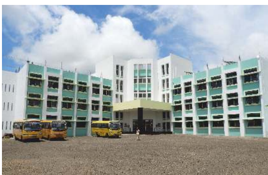
K.K. Wagh Arts, Commerce, Science & Computer Science College, Kakasaheb Nagar