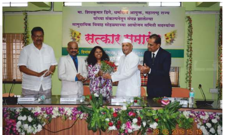
Charity Commissioner Programme 28.5.2018